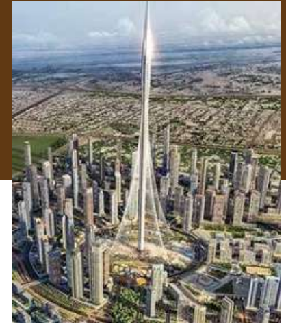
DUBAI CREEK HARBOUR